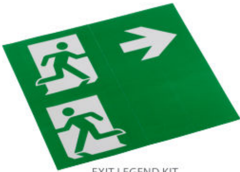
EXIT LEGEND KIT